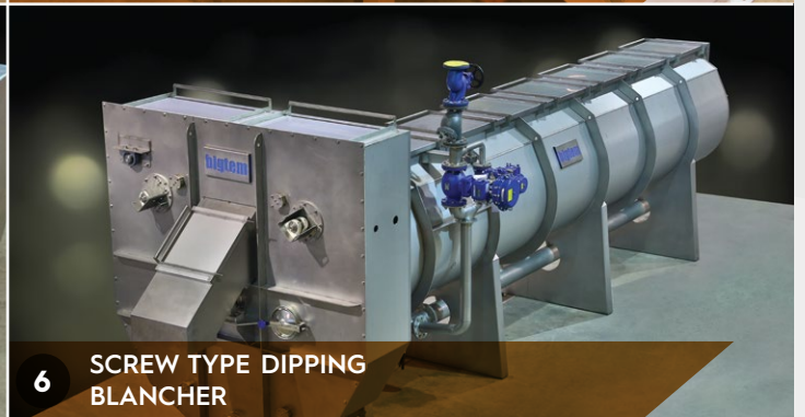
6 SCREW TYPE DIPPING BLANCHER