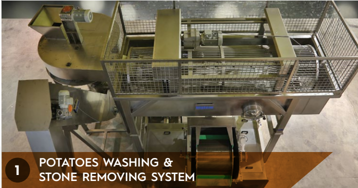
1 POTATOES WASHING & STONE REMOVING SYSTEM