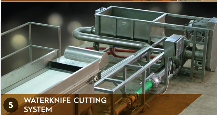
5 WATERKNIFE CUTTING SYSTEM