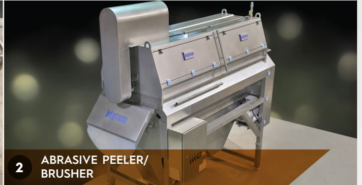
2 ABRASIVE PEELER/ BRUSHER