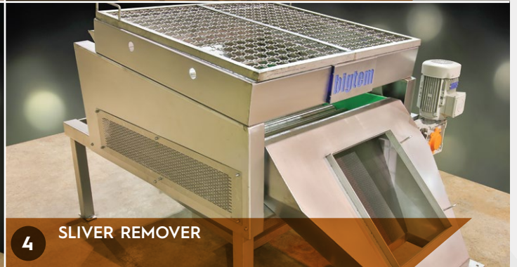
4 SLIVER REMOVER